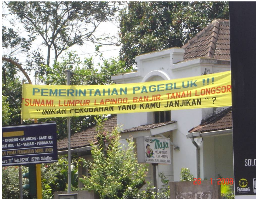
Figure 2. A political voice of the community of government opponents in Salatiga early 2008.

The banner reads: “PEMERINTAHAN PAGEBLUK!!! TSUNAMI, LUMPUR LAPINDO, BANJIR, TANAH LONGSOR – ‘INIKAH PERUBAHAN YANG KAMU JANJIKAN?’ (THE GOVERNMENT BRINGS ABOUT [or plagues the people with] DISASTERS!!! TSUNAMIS, ‘LAPINDO’ ERUPTIVE HOT MUD [in Sidoarjo, East Java], FLOODS, LANDSLIDES – ‘ARE THEY CHANGES YOU PROMISE?’). This provocative banner shows a very harsh Discourse (criticism) toward the ruling government. Despite being critical, the banner shows political “confusion syndrome” Discourses. First, some people are so confused and frustrated – as to how they are stricken by continuous calamities, that they are trapped in a serious logical fallacy. To illustrate, there have been disasters since 2004; Susilo Bambang Yudhoyono (SBY) has become the Indonesian president since 2004; SBY and the state apparatus have caused the disasters. Second, being confused, these people call for (if not incite) the society to condemn the present government. Third, by being judgmental in confusion and frustration, these people